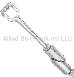
Allied Bolt Products LLC