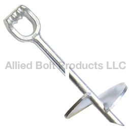
Allied Bolt Products LLC