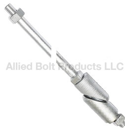
Allied Bolt Products LLC