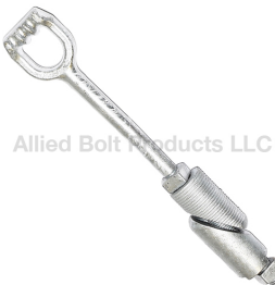
Allied Bolt Products LLC