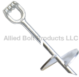
Allied Bolt Products LLC