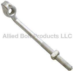
Allied Bolt Products LLC