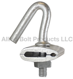
FIGURE 8 SPAN CLAMP (.148"-.250")