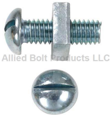
Allied Bolt Products LLC