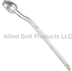
Allied Bolt Products LLC